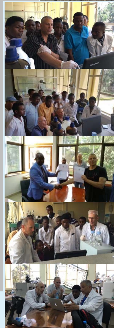
Figure 3. February 2019, Arusha Technical College, Tanzania. Intensive course for teaching, training and instructing the local water laboratory staff in conducting necessary water-quality analyses